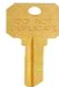
Do Not Duplicate (DND)