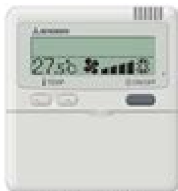
WIRED REMOTE CONTROL RC-E