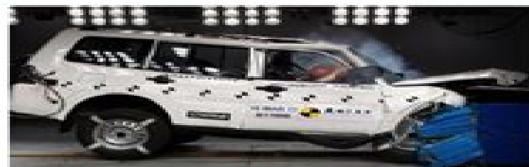
Frontal offset test at 64 km/h