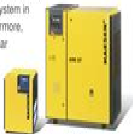
Series: SX - ASK

The SIGMA CONTROL basic is available with KAESER's SX, SM, SK and ASK series rotary screw compressors. It is the perfect solution for users who initially require a single compressor for their air supply, but who also may wish to expand the compressed air system in the future. Furthermore, KAESER's modular control and compressed air management concept ensures trouble-free system compatibility.