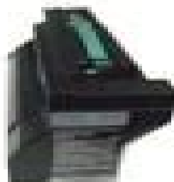
SIDE VIEW WASTE HOPPER