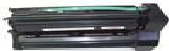
FRONT VIEW OF CARTRIDGE