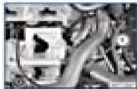
Remove coolant hose (1).