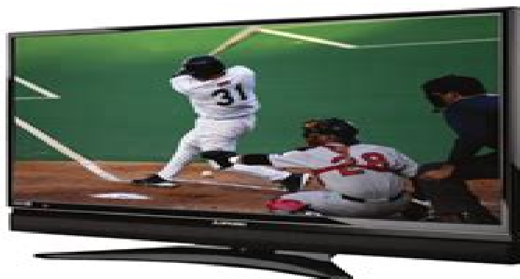
LT-46149 Shown on Included Base