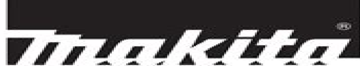
Table Saw Instruction Manual