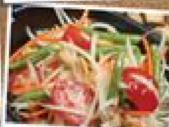
THAI STYLE PAPAYA SALAD