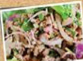
SPICY MINCED CHICKEN, PORK OR BEEF