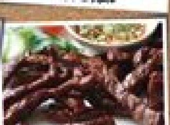
FRIED GARLIC WITH CHICKEN, PORK OR BEEF