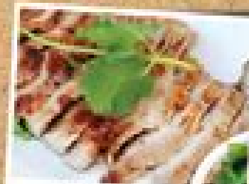
BBQ CHICKEN, PORK OR BEEF