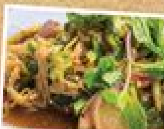
BAMBOO SHOOT SPICY SALAD