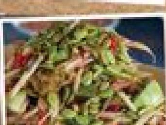
PAPAYA SALAD WITH SALTED CRAB & FERMENTED FISH