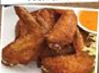
FRIED CHICKEN WINGS