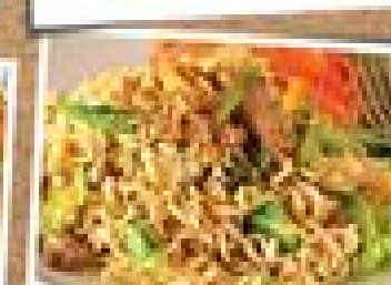
STIR FRIED INSTANT NOODLE WITH CHICKEN, PORK OR BEEF