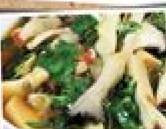
MUSHROOM SOUP (ESAN STYLE)