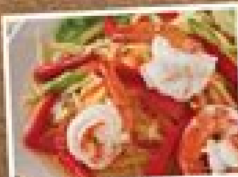
PAPAYA SALAD WITH SEAFOOD