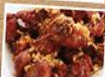
FRIED PORK RIBS WITH GARLIC