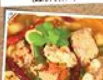
PORK SPARE RIBS IN SPICY SOUP