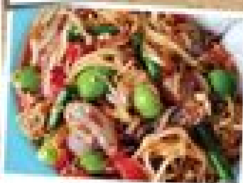
PAPAYA SALAD WITH FRESH SHRIMPS