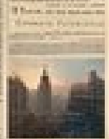
From New York