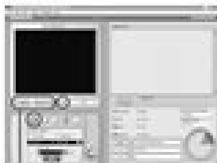
Playback control buttons