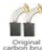
Original carbon brush