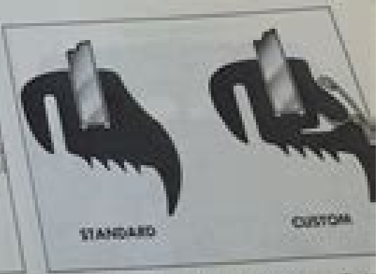
Fig. 3-Cross Section of Weatherstripping (1 of 2)