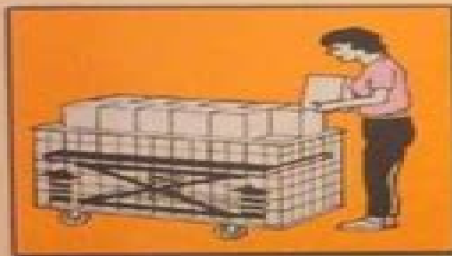
◀ SPRINGS DOLLIES ▶