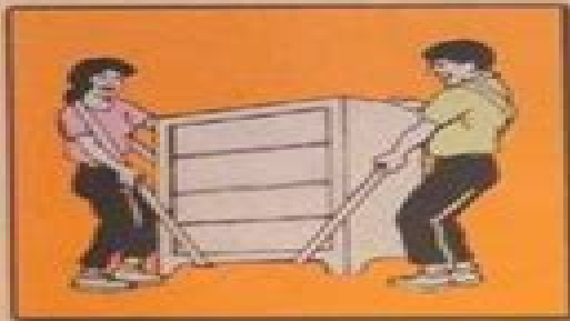
◀ STRAPS TROLLEYS ▶