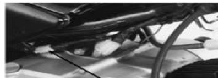
CONECTOR 2P DO INTERRUPTOR DA LUZ DO FREIO TRASEIRO

Deverá existir continuidade com o freio traseiro acionado. A continuidade deverá cessar quando o freio traseiro é solto.