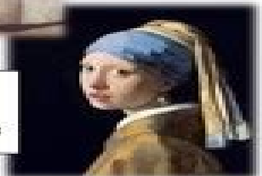
Girl with a Pearl Earring by Johannes Vermeer