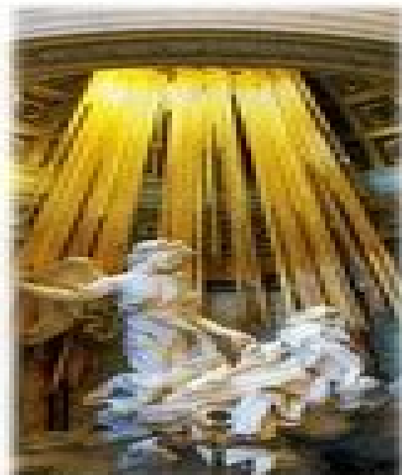
Above - The Ecstasy of Saint Teresa by Bernini (1650)