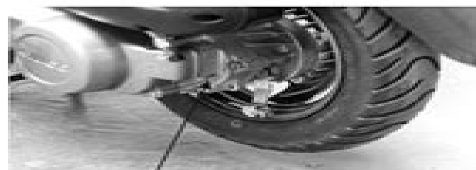
Oil Check Bolt/Sealing Washer