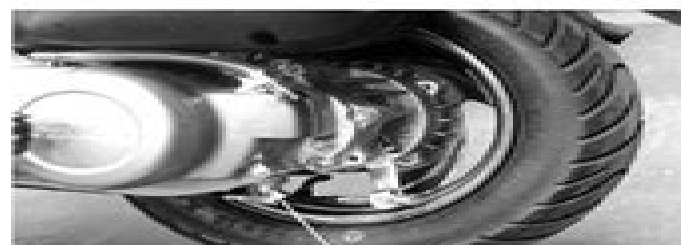
Drain bolt / Sealing Washer

Reinstall the oil check bolt and check for oil leaks. Torque: 0.8~1.2 kgf-m