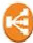
Elastic Load Balancing