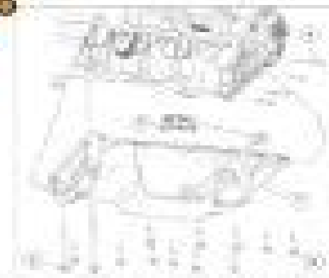
Fig. 87: Locating Timing Chain Courtesy of FORD MOTOR CO.