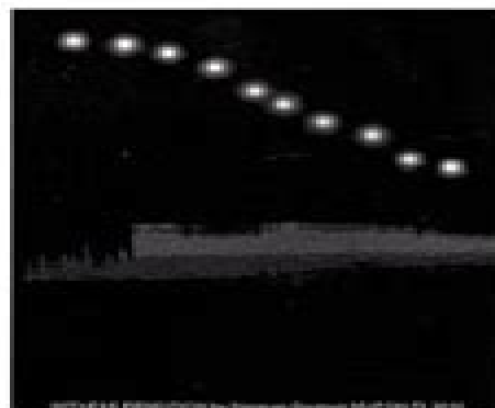
© 2012 MUFON. All rights reserved. Photo by Norman Gagnon. MUFON File # 2012