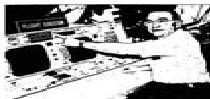
The late Paul Cerny during NASA Mission Control Tour, 1980 MUFON UFO Symposium.