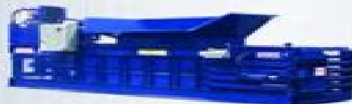
Horizontal Closed End Balers