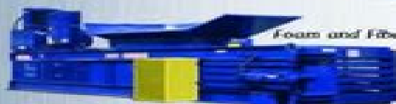
Foam and Fiber Balers