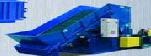
Answer Two-Ram Baler