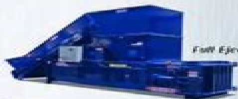
Full Eject Balers