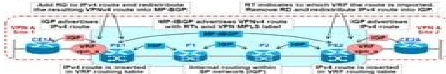
Figure 3. End-to-end route propagation.

Observe that the VPN routes are processed only by the PE routers. The other routers in the SP network need not know anything about VPN addresses and routes. In particular, the IGP running within the SP network is not involved in VPN route propagation (it supports the VPN only by providing internal routes needed to set up LSPs between PE routers). We use RIPv2 in the SP network.