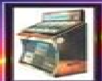
1941 Seeburg AT160