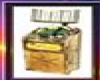
1962 AMI Continental

PRICE & IDENTIFICATION GUIDE CURRENT VALUE & PHOTOS OF OVER 700 JUKEBOXES, WALLBOXES & SPEAKERS FROM 1920-1990's