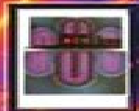
1977 Seeburg STD4