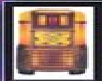
1941 Rockola Master