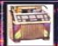
1932 Seeburg M100C