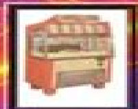
1955 AMI G129