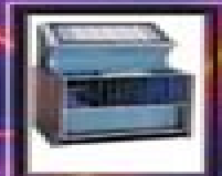
1972 Rockola 449