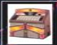
1968 Rowe R92