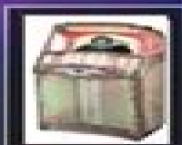
1956 Wurlitzer 2000