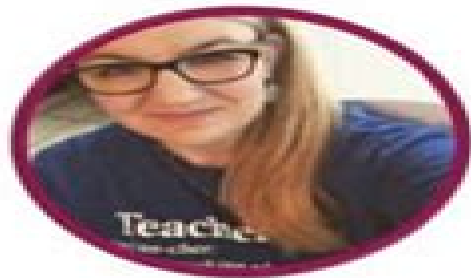
Tales Of A Fourth Grade Educator