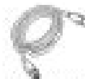
USB Interface Cable