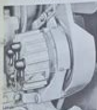
Fig. 2 - Alternator installed (Kendall Type)

The M1000 (10-14) alternator is a 12-volt self-excited synchronous generator. The current coil is located in the stator and the rotating coil is the rotor. The rotating current is supplied by the variable impedance (V-I) through the regulator, two brushes and slip rings to the starting coil in the rotor.