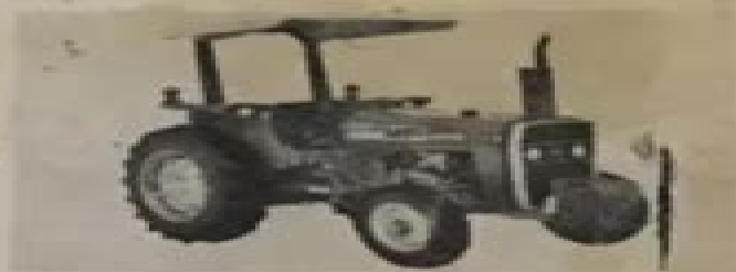
MF 245 TRACTOR