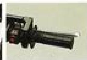
Twist this grip and super goodby to competition.

The 1987 KXT250 Tecate. Strictly for riders who are serious about having fun.