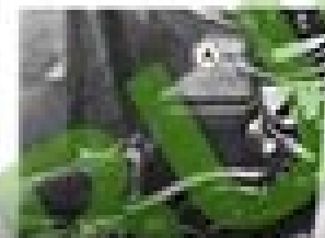
A. Oil Pressure Switch Connector B. Side Stand Switch Lead Connector C. Neutral Switch Connector D. Starter Motor Lead Terminal