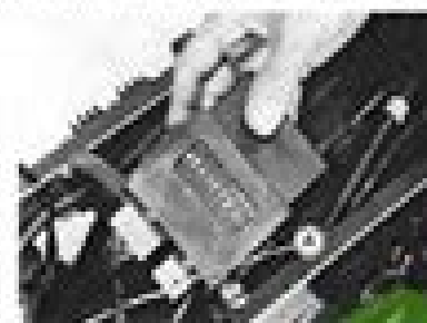
A. Pickup Coil Lead Connector