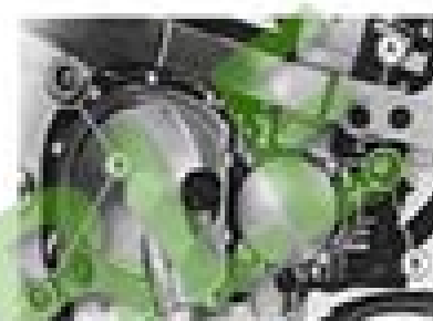
A. Engine Mounting Bolts and Nuts