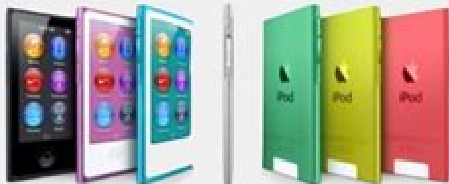
New iPod nano