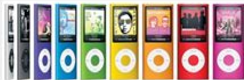
4G iPod nano