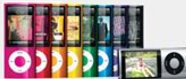
5G iPod nano