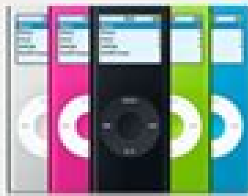
2G iPod nano