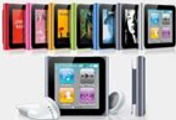
6G iPod nano