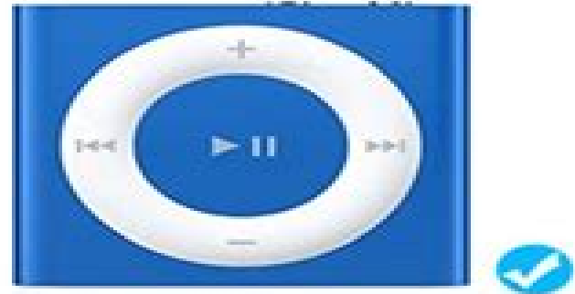
iPod shuffle 4/5/6/7