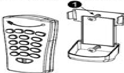
Figure 2 - Mounting

Drill 2 holes in mounting surface, insert wall anchors and fasten the bracket with 2 screws