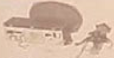
Figure 1: Typical use of the system.

The information in this manual is intended to provide the user with a general understanding of the system and its operation. It is not intended to be a substitute for the detailed instructions in the service manual. The user should always refer to the service manual for complete information on the system and its operation. The system is designed to provide a reliable and efficient means of communication. It is capable of operating in a variety of environments and under a wide range of conditions. The system is designed to be easy to use and to provide a high level of performance. The system is designed to be reliable and efficient. It is capable of operating in a variety of environments and under a wide range of conditions. The system is designed to be easy to use and to provide a high level of performance.