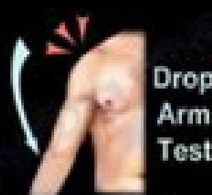
Rotator Cuff Tear