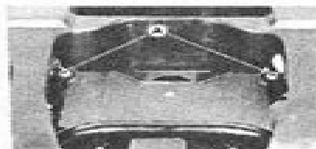
Air cleaner cover screws (A)