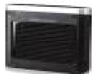
Bluetooth Solar Car Kit (HSC-500)