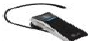
Bluetooth® Headset (HBM-500)

Accessories for productivity, convenience, and fashion are available at att.com/wireless .