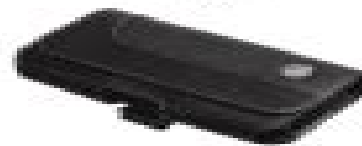
Carrying Case (HMC0000141/0)

microSD™ is a trademark of SanDisk. The Bluetooth® word mark and logos are registered trademarks owned by Bluetooth SIG, Inc. and any use of such marks by LG Electronics, MobileComm, U.S.A., Inc. is under license. AT&T marks contained herein are trademarks of AT&T Intellectual Property and/or AT&T affiliated companies. Microsoft product names listed registered with permission from Microsoft Corporation. © 2009 AT&T Intellectual Property. All rights reserved. All other marks are proprietary to their respective owners.