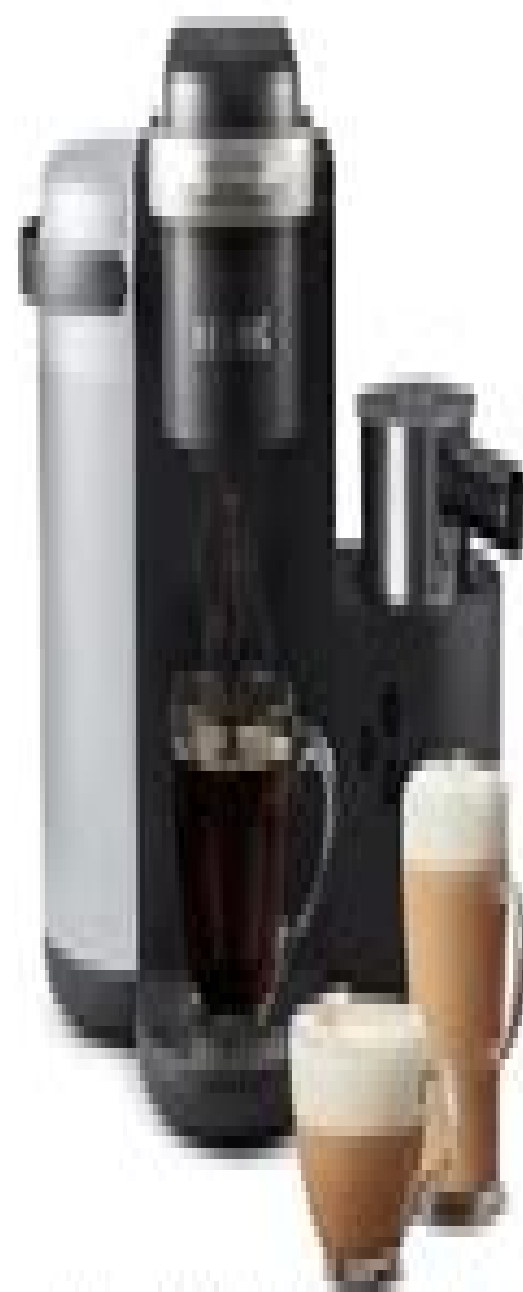
Keurig K Cafe Special Edition