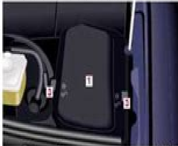
1 - Fuse box in engine compartment, left-hand side 3 - Tabs