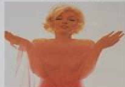
A BEAT OF TWO