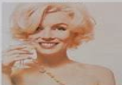
HERE'S TO YOU