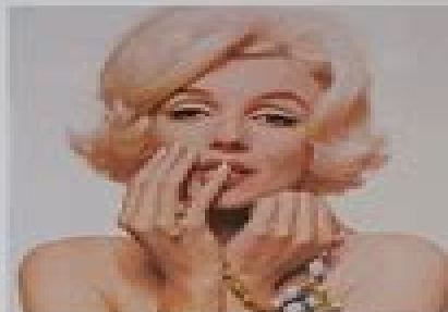
WHEN'S IT ALL ABOUT?