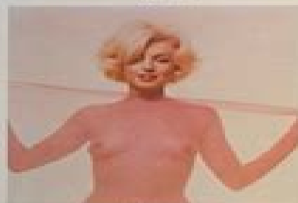
WANT TO GET YOUR