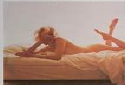
JUST A JOKE