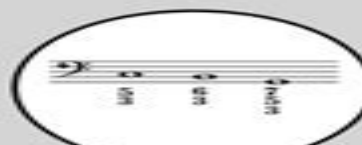
4. Homophonic Writing