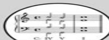
2. Harmonic Progression