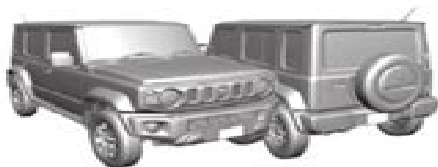
Model The Jimny model is one of the JIMNY series.

This owner's manual applies to the JIMNY series.