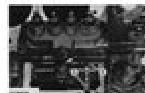
(1) Crank Gear (2) Crank Gear (3) Crank Gear (4) Crank Gear (5) Crank Gear (6) Crank Gear (7) Crank Gear