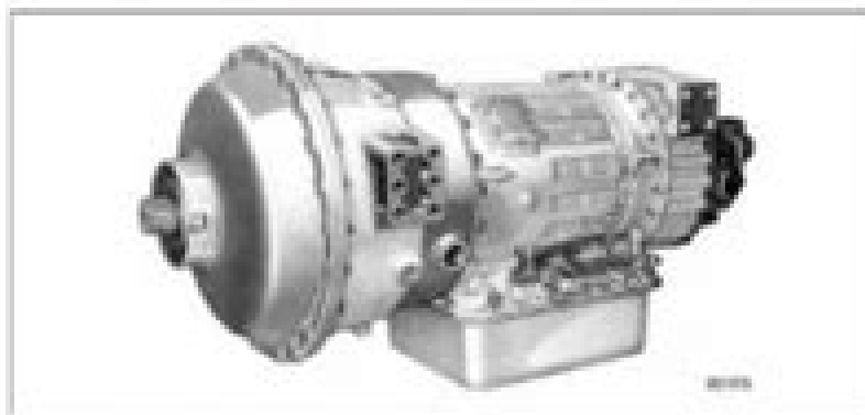
Figure 1. CLBT 750/754 Remote Mount