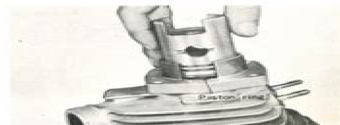
Fig. 8-10-4 Inserting piston ring into cylinder