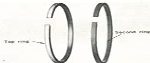
Fig. 8-10-2 Piston rings