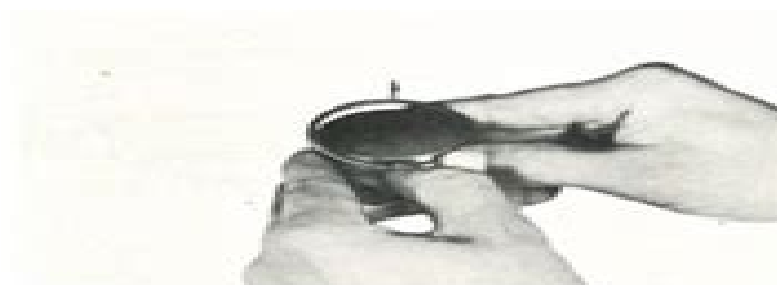
Fig. 8-10-3 Removing piston ring