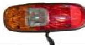
Rear Light Assembly