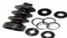
TWC Minor Kit