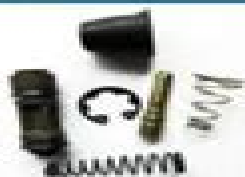
TWC Major Kit