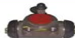
Wheel Cylinder Assembly