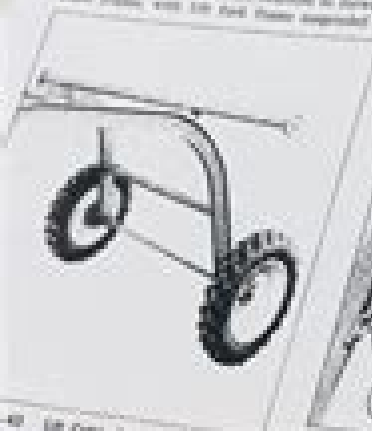
Fig. 44. Lift Cable Support Rod

8. Attach the two shock brackets to forward main frame, use lift rod frame suggested in