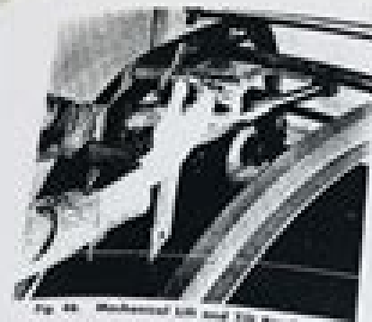
Fig. 48. Mechanical Lift and Lift Rod View

10. Attach the fork end at the rear of the lift stand, to the welded leg on the forward frame over beam by means of a retaining pin and two cotter pins, making sure to insert the two spacer washers provided.