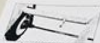
Fig. 42. Forward View View

Wash frame using two \frac{1}{4} x 2 1/2 inch bolts.