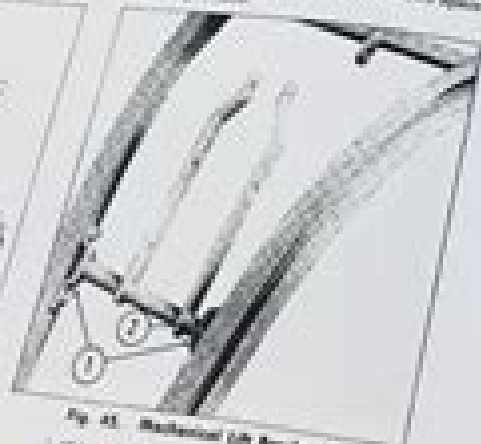
Fig. 45. Mechanical Lift Brackets