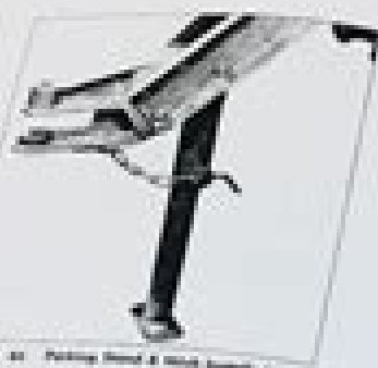
Fig. 46. Parking Stand & Shock Assembly

between, short end of fork shaft to the left (view direction of travel) see Fig. 45. Use four \frac{1}{4} x 2 inch bolts.