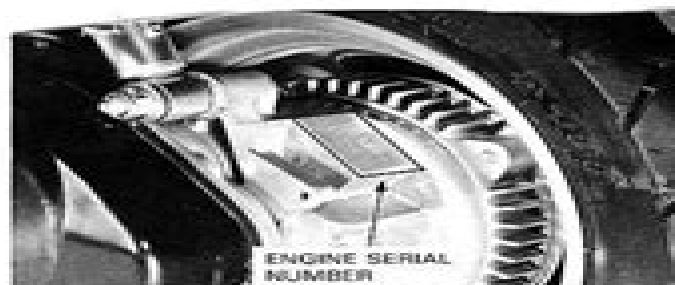
ENGINE SERIAL NUMBER

The VIN (Vehicle Identification Number) is attached to the left side of the leg shield.