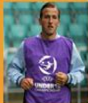
HARRY KANE toutCOMMENT