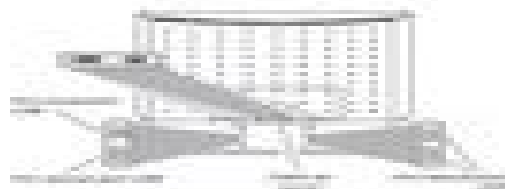
Fig. 1: Beleuchtung eines Raumes mit 120 cm Breite und 120 cm Tiefe.

Beleuchtet einen Bereich von 120 cm Breite und 120 cm Tiefe. Einmal einstrahlend wird ein Bereich von 120 cm beleuchtet (Fig. 4).