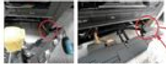
Audi A8 Connector of Climate controller